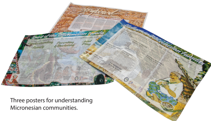
Three posters for understanding Micronesia communities.

In Micronesia, formal programs and institutional care are often not available or discouraged because engaging in such services bring the illness outside of the private, family setting. Hence, the use of natural helpers is essential to addressing needs of the individual and family who can benefit from services. Natural helpers can serve to link those in need of services with others who have the knowledge and skill to provide the service. Specifically, traditional healers are knowledgeable of herbal remedies, healing massage, and spiritual practices to address an array of ailments.