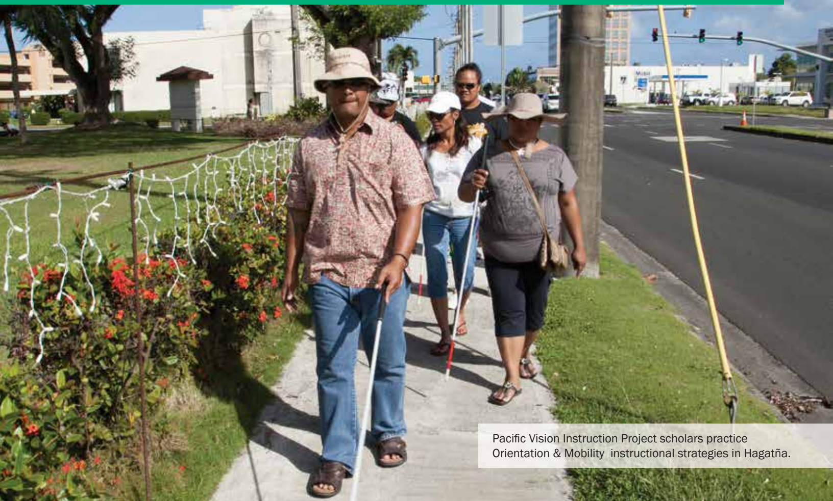
Pacific Vision Instruction Project scholars practice Orientation & Mobility instructional strategies in Hagatña.