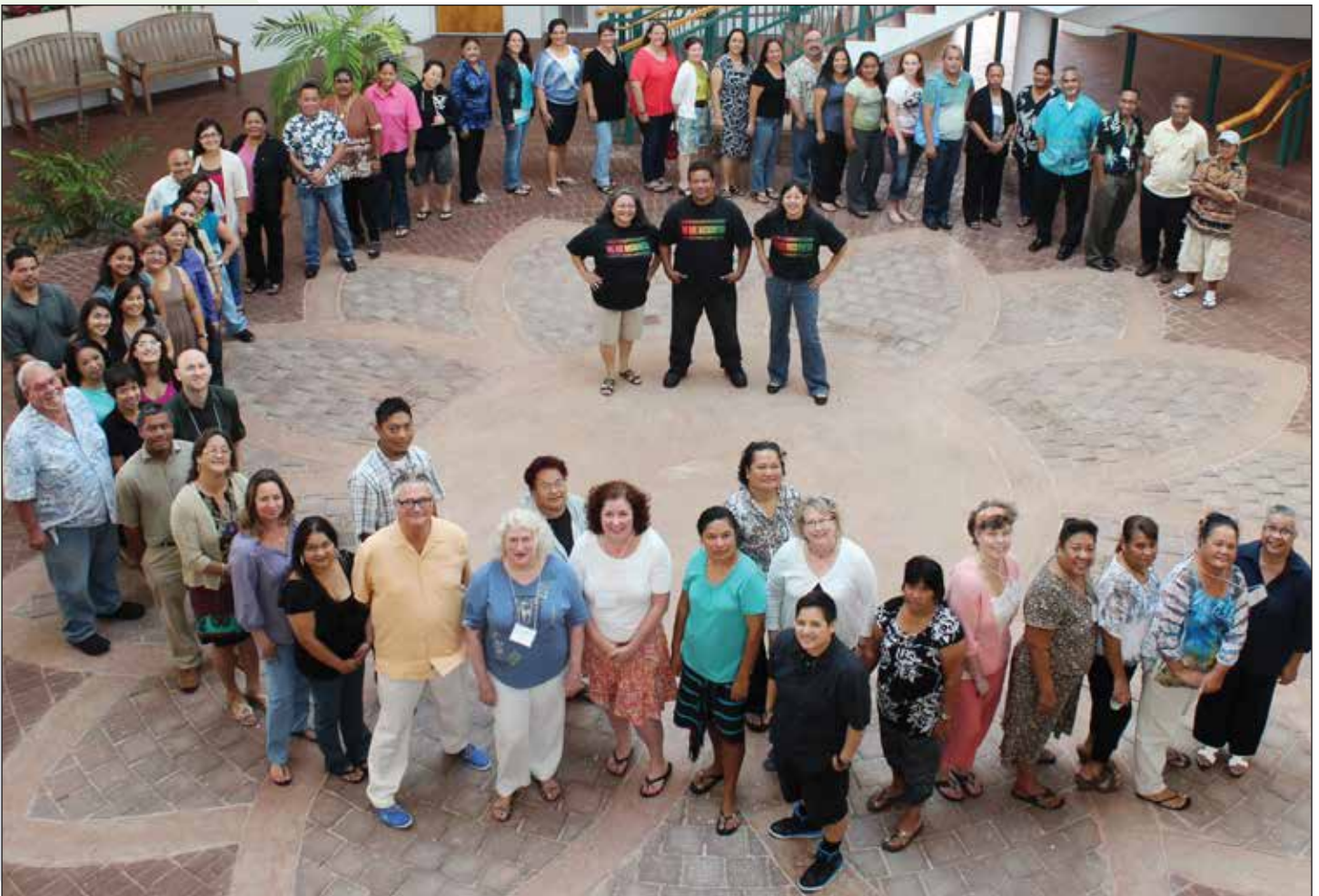
Sixty education team members from Guam, CNMI, FSM, and Palau, with the "Thinking Through Collaboration" (TTC) facilitators from North Central Regional Resource Center and Western Regional Resource Center and technical assistance providers from San Diego State University and Guam CEDDERS, create a BIG "C" to communicate their commitment to the "Thinking Through Collaboration" training strategies, especially the 4 C's: Communication, Cooperation, Coordination, and Collaboration!

with significant cognitive disabilities. Through the formation of the Pacific Assessment Consortium (PAC6) in 2005, Guam CEDDERS was instrumental in obtaining USDOE Individuals with Disabilities Education Act (IDEA) grants, in partnership with National organizations and experts, to administer the priorities of the PAC6 for the inclusion of students with significant cognitive disabilities in each entity's accountability system, the state-wide assessment system. The USDOE IDEA-funded Pacific Assessment Consortium Implementing Fully Innovative Change (PACIFIC) Project ended in March 2013, but did not end the continued efforts of the PAC6. The exceptional approach of the PACIFIC Project built upon promising new strategies of the PAC6 collaborative regional approach to delivering critical technical assistance and training support