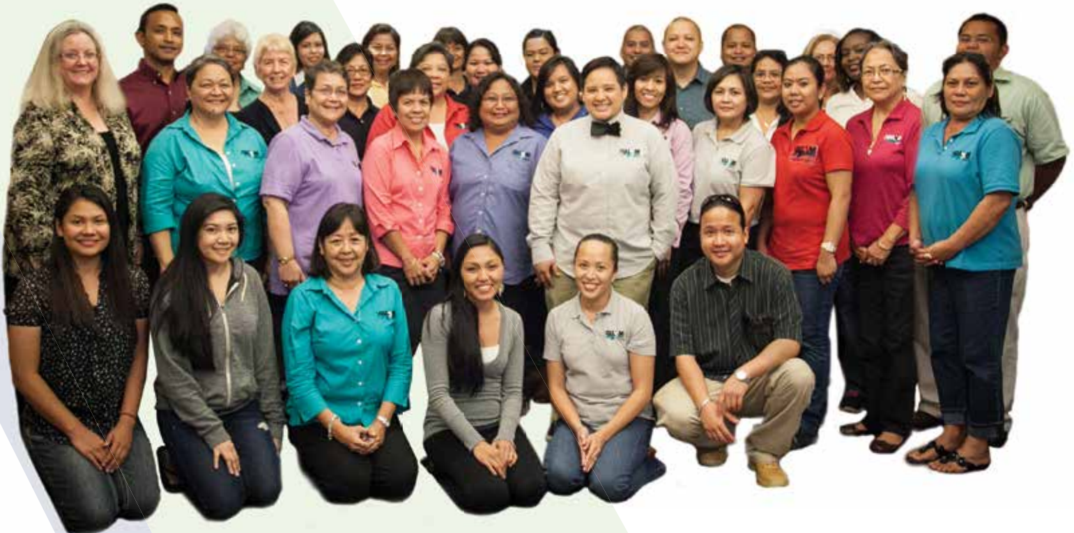
GUAM CEDDERS STAFF

In partnership with individuals with disabilities and their families, agencies, organizations, and service providers, Guam CEDDERS creates pathways that enhance, improve, and support the quality of life of individuals with developmental disabilities and their families.