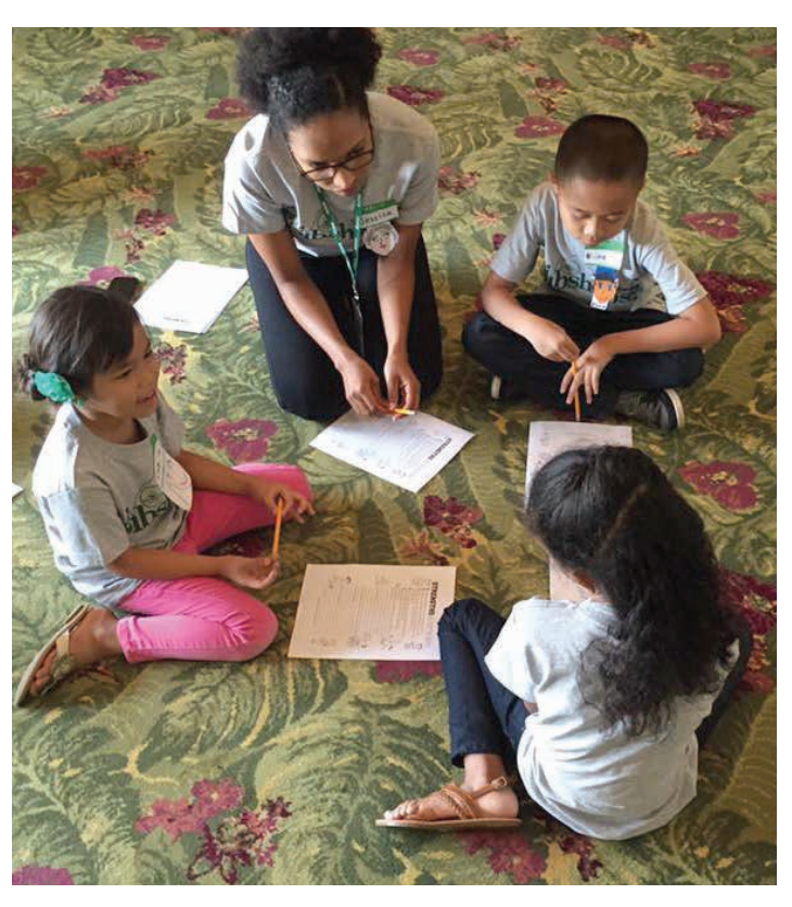
Sibshop participants engage in a series of activities lead by workshop facilitators.