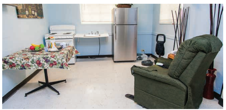
Photos pictured above show GSAT Demo Center and Model Home Features. Requests for a demonstration can be made by calling GSAT staff at 735-2490 (v), 735-2491 (v and TTY), or visit the GSAT website at <a href="https://www.gsatcedders.org">www.gsatcedders.org</a>.