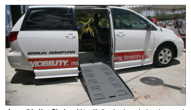
Accessible Van Display. Atkins Kroll, a local car dealer, showcased their accessible van during the Fair.