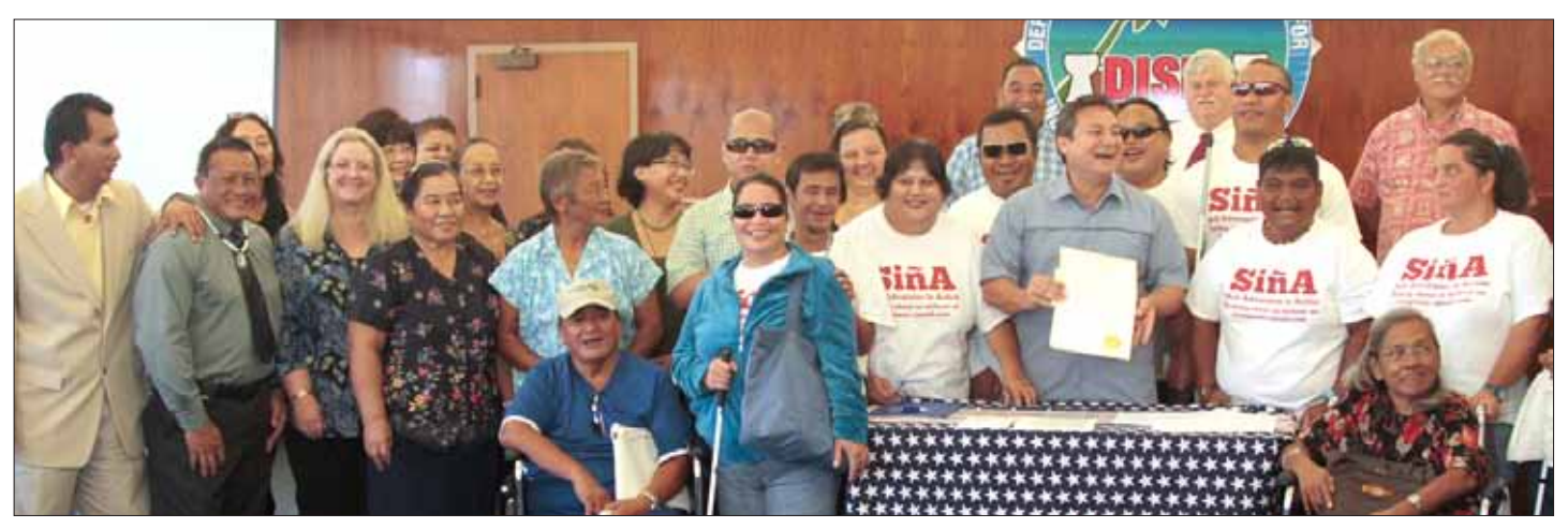
Self-Advocates and agency representatives join Governor Eddie Baza Calvo during the signing of the proclamation commemorating the 21st anniversary of the Americans with Disabilities Act.

The Americans with Disabilities Act (ADA) is twenty-one years old! To commemorate this landmark legislation, Guam residents celebrated the ADA's anniversary with a ceremony on July 26 at the Department of Integrated Services for Individuals with Disabilities (DISID). The celebration featured the signing of a proclamation by Governor Eddie B. Calvo recognizing this important legislation and how it has impacted the lives of all Americans, most especially residents of Guam.