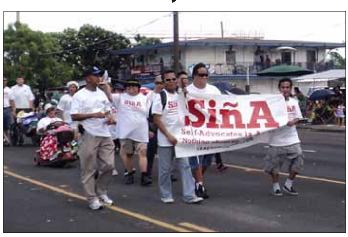
The proud members of SiñA celebrate their participation in the 2011 Liberation Day parade and festivities.