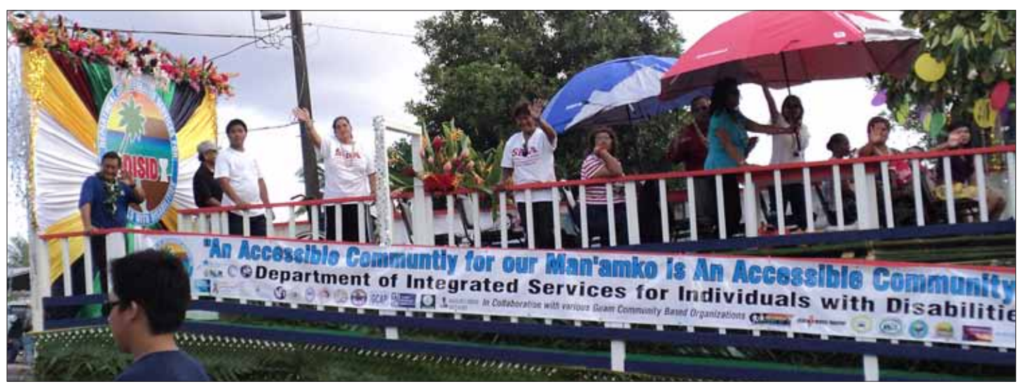
Individuals with disabilities, their families, and community supporters joined efforts to build the first-ever Liberation Day parade float. Go to the bottom of page 8 for another Liberation Day photo.