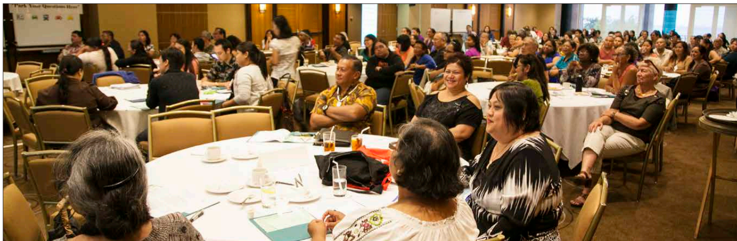
Approximately 200 participants from Guam and the Commonwealth of the Northern Mariana Islands attended the 20th Annual Assistive Technology Conference held on March 28 at the Westin Resort & Spa.