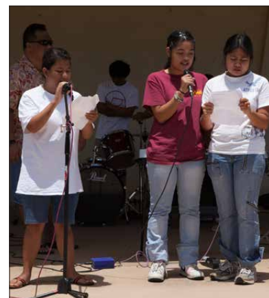
Siña Youth add to the music entertainment with their spirited vocal numbers.