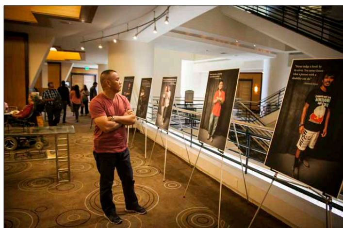
One participant carefully reflects on the Guam CEDDERS Gallery. The Gallery featured nine poster-sized portraits of people with different abilities and a quote describing their thoughts on the challenges they have conquered.