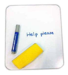
Dry-Erase White Board

At every polling place, there is an Assistive Technology Kit filled with some low-tech items that can help make your voting process easier. Some items included are: