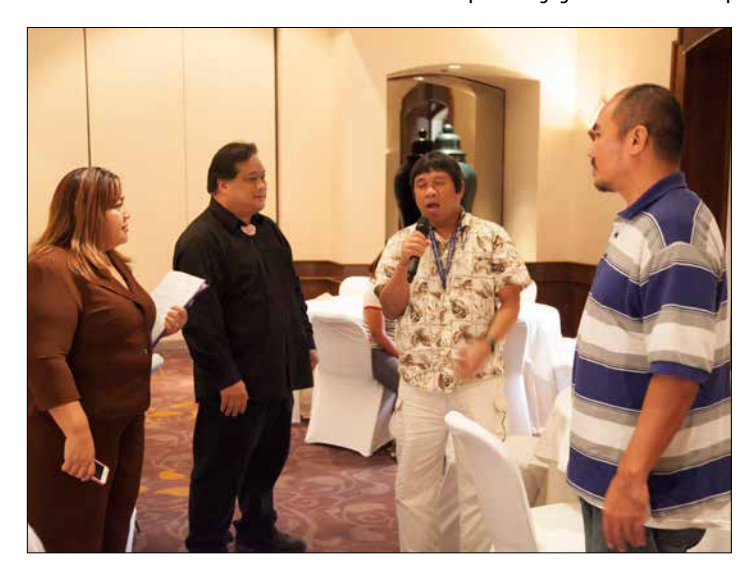
Self-advocacy in Action! A participant responds to the call to voice his opinion.