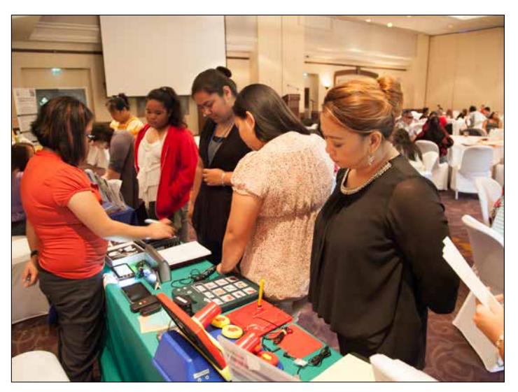
Assistive technology displays, information on Emergency Preparedness, Legal, and other services drew the interest of participants to display tables during breaks.