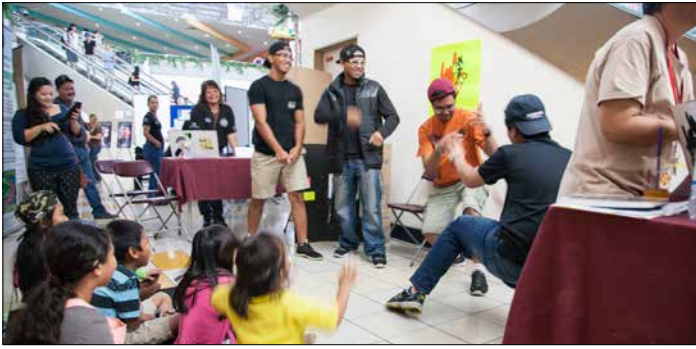
Children laugh excitedly as the Guam Community College American Sign Language (ASL) class performs popular childrens cartoon themes in a very animated and entertaining form of ASL during Children's ASL Story Hour at this years Assistive Technology (AT) Fair at the Micronesia Mall on March 7.