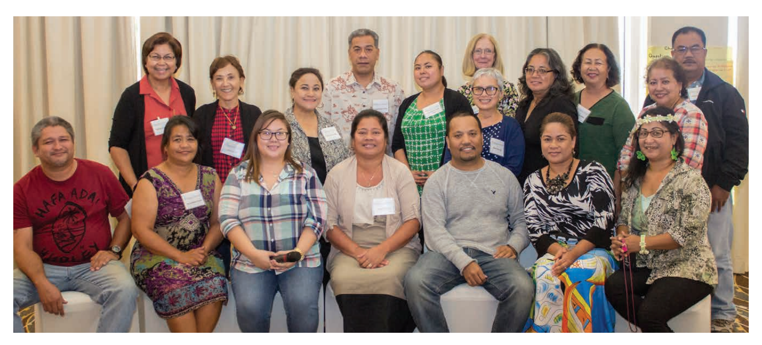
On July 14, participants from the previous Guam LAUNCH Cultural Conversations Café gathered to validate data collected at the prior Cafés. Representatives from the Chamorro and Chuukese communities as well as Guam CEDDERS and Guam LAUNCH staff posed for a group photo during the Café.

As an important next step, a follow-up Café was conducted on July 14th. This was an opportunity for the cultural representatives to review the data summaries, validate their accuracy, and to provide further clarification of their input. Participants' responses to the data summaries was very positive and they provided even more information that will be useful for Guam LAUNCH and other service providers. Further data analysis is currently underway. Once the final report is completed, it is anticipated that the information will be made available to service providers in the form of "tip sheets."