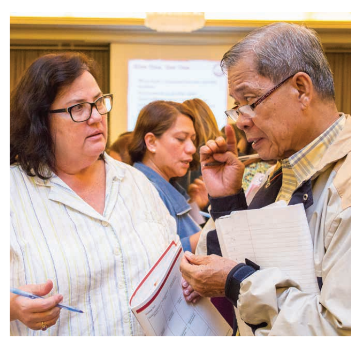
State Systemic Improvement Project (SSIP) School participants connected with their Quadrant Partners to share their ideas with teachers they don't usually interact with so they can gain different perspectives.

Through a contract with the Guam Department of Education (GDOE), Guam CEDDERS in collaboration with the Wisconsin School District of Menomonee Falls (SDMF) provided a two-day professional development (PD) session for the four GDOE State Systemic Improvement Project (SSIP) participating elementary schools on August 15-16.