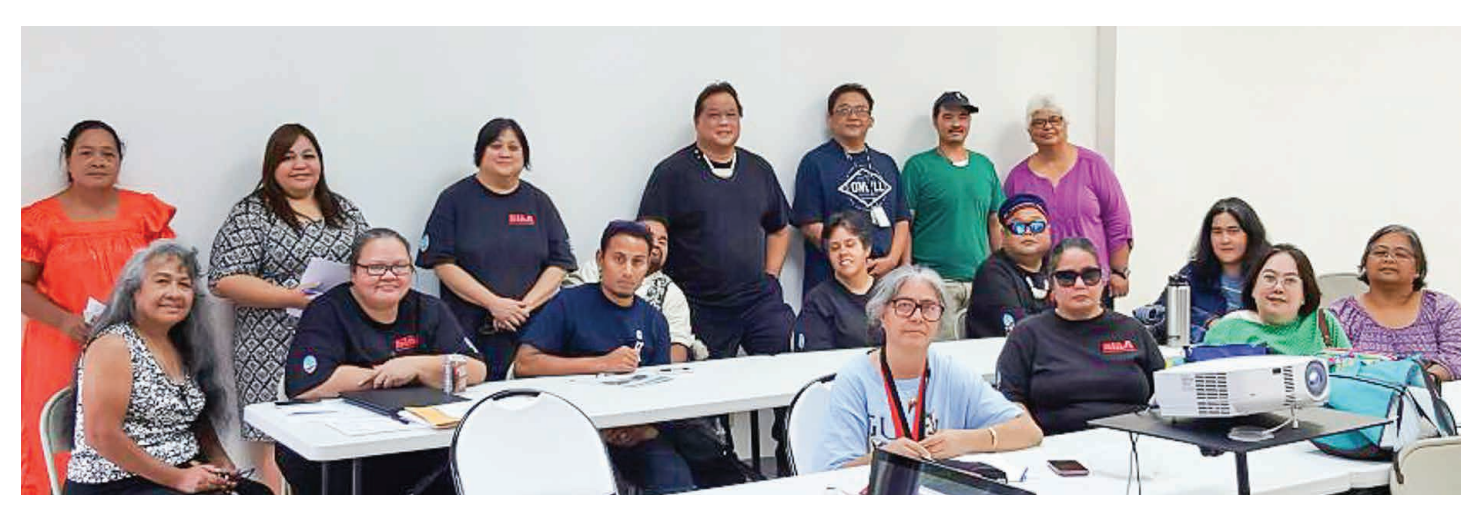
Guam CEDDERS showed the latest draft of "Ta Fan Acomprendi: Communicating with People with Disabilities" to SiñA members on August 13 during their Self-Advocacy Refresher Workshop. Feedback received was very positive. Next steps include finalizing edits and adding audio description.