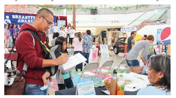
Fathers obtain information on early hearing and development during the Breastfeeding Awareness event held at the Micronesia Mall on August 20.