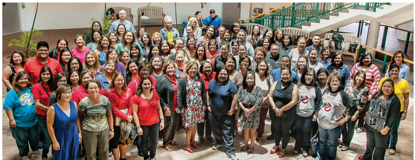
"SPED Buster" was the theme to energize the August 12 Division of Special Education Orientation session at the UOG School of Business.