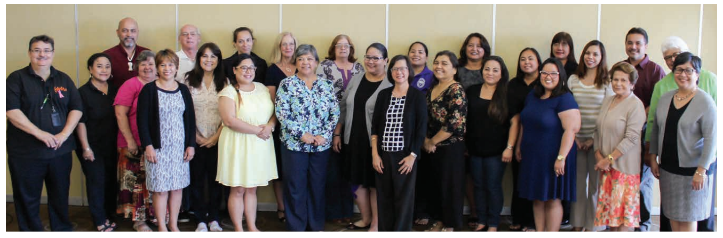
Members of the Project Tinituhon Strategic Management Team pose for a group photo during a break at the June 22 meeting at the Westin Resort.