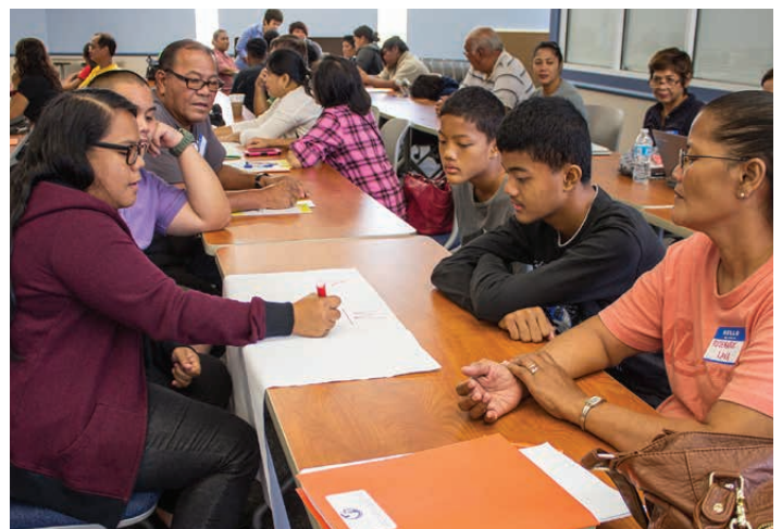
Parents and their children in grades 8th through 10th complete an exercise during the parent transition training held at UOG.