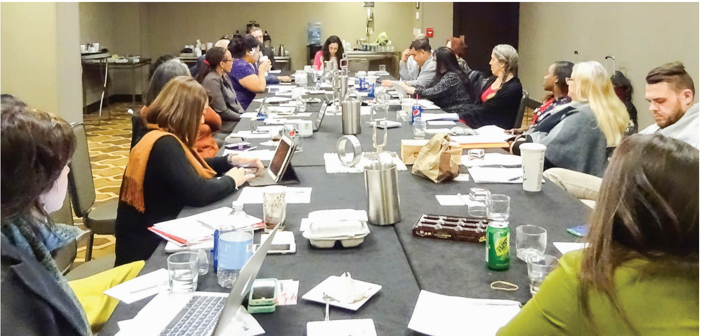
The Association of University Centers on Developmental Disabilities (AUCD) facilitated the third annual meeting with the University Centers on Developmental Disabilities (UCEDD) leadership from the five U.S. Territories including American Samoa, Commonwealth of the Northern Mariana Islands, Guam, Puerto Rico, and the Virgin Islands on December 7 in Washington, D.C. In addition to program updates, officials from the U.S. Department of Health and Human Services, Health Services Resources Administration joined in the meeting to discuss strategies to address concerns relating to the Zika virus.