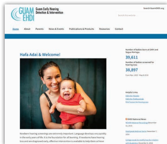
New Guam Early Hearing Detection and Intervention (Guam EHDI) Website