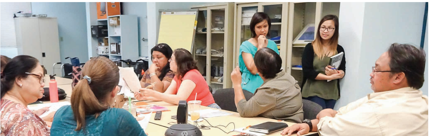
On February 20, Marianas Alliance of Speech/Hearing Professional (MASHP) met with Educating Pacific Island Clinicians in Speech Language Pathology (EPICS) Scholars to provide the opportunity to network and discuss the arrangements to earn clock observation hours.