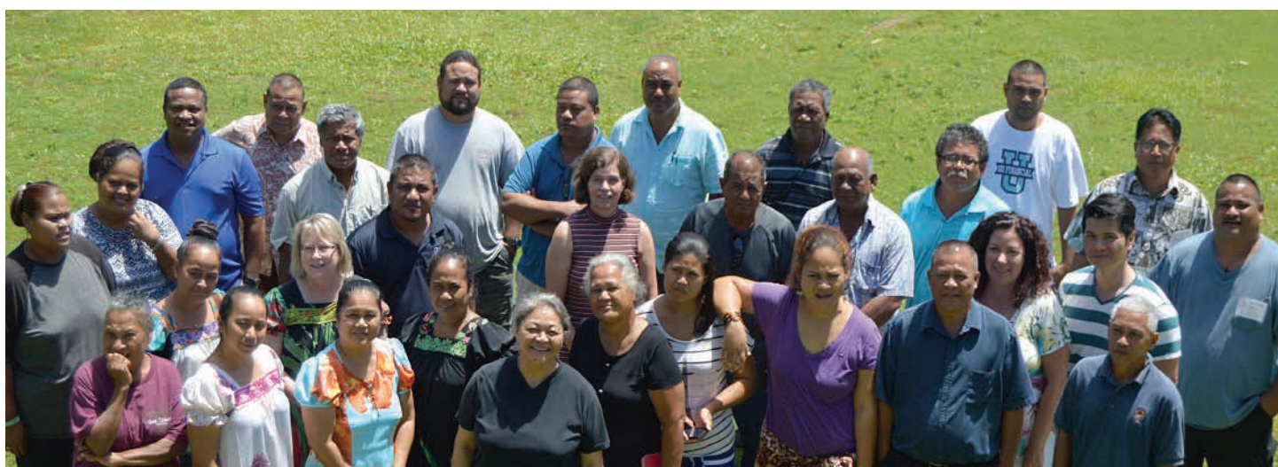
FSM SSIP stakeholders, with Guam CEDDERS, University of Oregon, and Sigma Associates partners, convene in Yap State, FSM, March 6-10, 2017