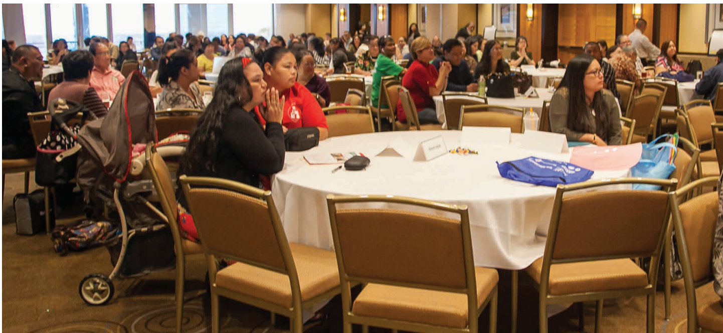
A record 171 people attended this year's Assistive Technology Conference on March 10 at the Westin Resort Guam.