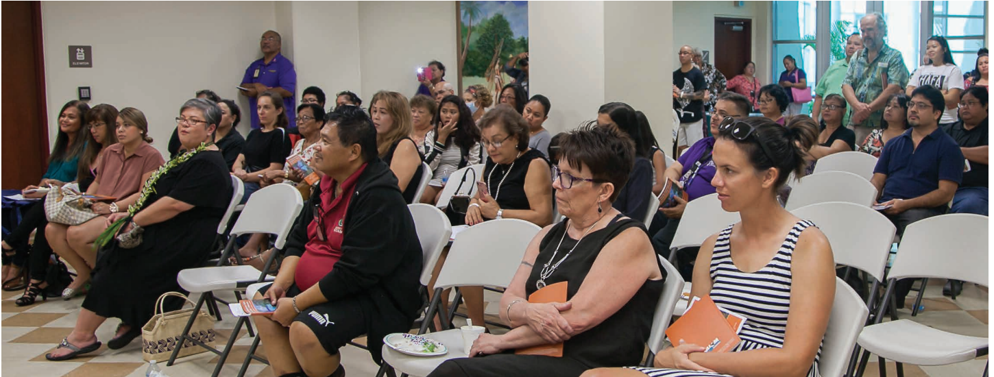
Approximately 75 community members attended the launch of “Fino’ Siha Put Kinalamten Salut Yan Inutet Gi I Fino’ Chamoru (Behavioral Health and Disabilities Glossary in Chamoru)” held on August 4 at the Senator Antonio M. Palomo Guam Museum and Educational Facility in Hagåtña.

The production of this Glossary was made possible through the collaborative efforts of the Guam CEDDERS, Project Kariñu and Guam LAUNCH under the Department of Public Health and Social Services, and the PEACE Program under the Prevention and Training Branch of the Guam Behavioral Health and Wellness Center.