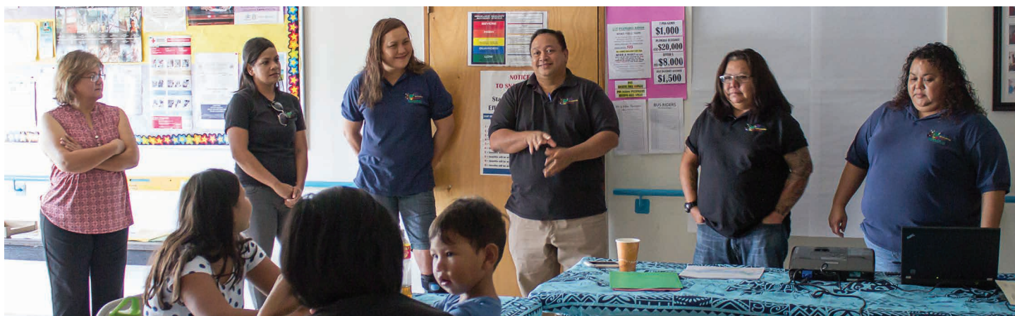
Although an unscheduled power outage occurred in the village of Agana Heights on Saturday, August 19, the Guam Early Intervention System (GEIS) still continued to host their "Parent Meet & Greet" which was held at the Agana Heights Senior Citizens Center. GEIS staff took turns introducing themselves to parents in attendance and shared why they enjoy working with families.