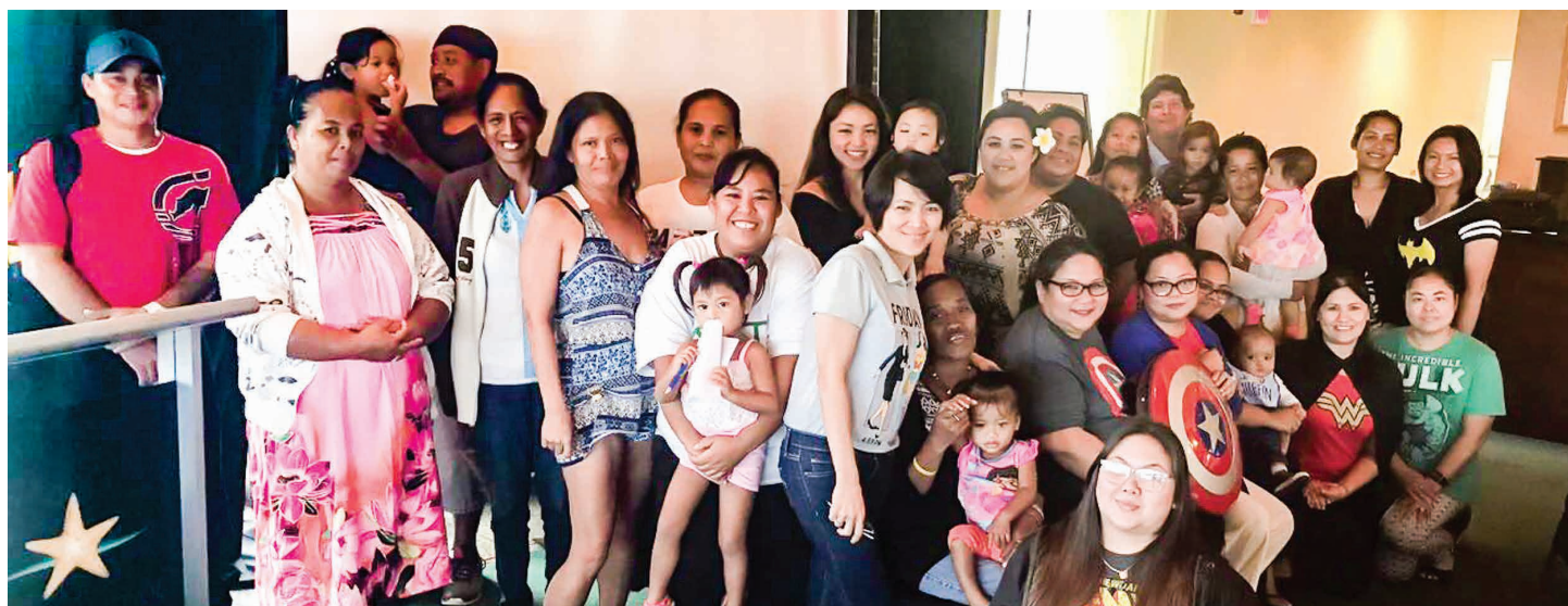
Project Bisita I Familia held a Parent Café, on August 18 at the Pacific Star Resort & Spa. The Parent Café theme was on "Being a Strong Parent" and focused on the 2 protective factors: 1) Parents Need to Help Their Children to Communicate/ Children's Social and Emotional Development and 2) Being a Great Parent Is Part Natural and Part Learned/ Knowledge of Parenting and Child Development.