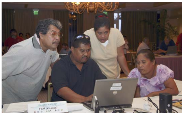
Team Kosrae focuses on developing a lesson for students with print disabilities using the assistive technology provided by the CIMAP project.

At the conclusion of the Institute, a set of equipment and software, worth a total of about $300,000, was packed and shipped to each of the nine island entities – American Samoa, Commonwealth of the Northern Marianas, Chuuk, Kosrae, Pohnpei, Yap, Guam, Palau and Republic of the Marshalls. As a final activity, each entity crafted an action plan showing how they plan to provide timely educational materials in appropriate accessible formats for students with disabilities using the technology learned. Project staff will be conducting site visits to provide assistance, as needed, in implementing the action plans. For more information on Pacific CIMAP, visit http://www.guamcedders.org and click on Project Resources.