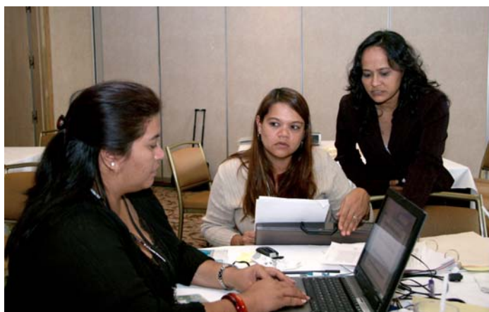
The Guam Team brainstorms during one of the periods set aside for entities to develop implementation strategies specific to their local school system.