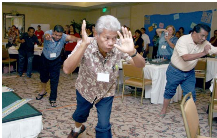
After long periods of concentrated cerebral efforts, Institute participants “get up and move” to get the blood flowing during a break.

The PACIFIC Project is funded by a U.S. Department of Education, Office of Special Education Programs, General Supervision Enhancement Grant.