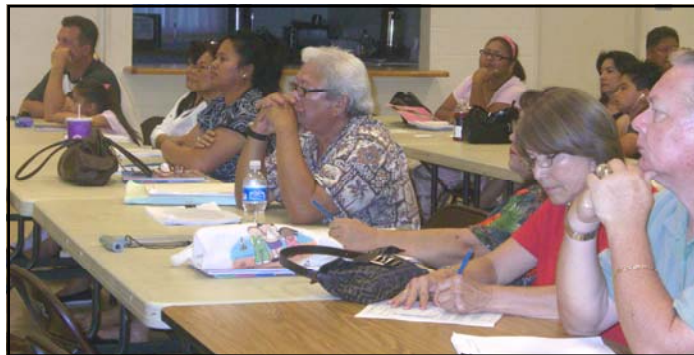
The July 17 Community Forum held at the Dededo Community Center was well-attended by parents, services providers, and other stakeholders.