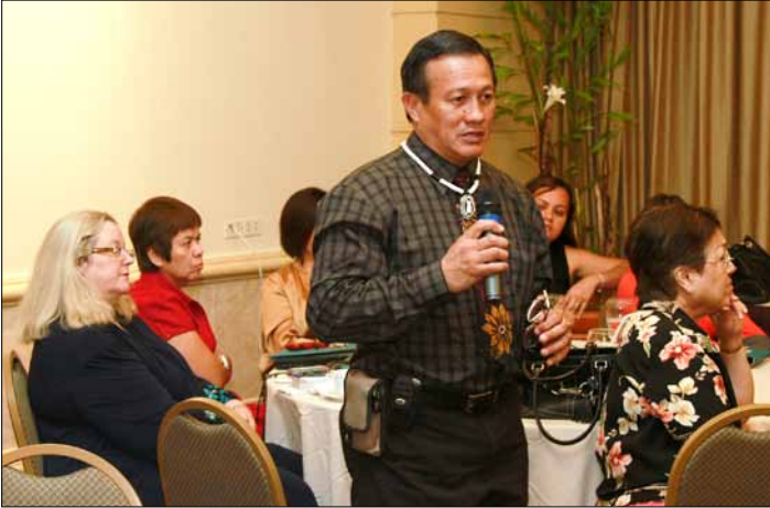
Ben Servino, Director of the Department of Integrated Services for Individuals with Disabilities, delivers the keynote address during the AT Conference.