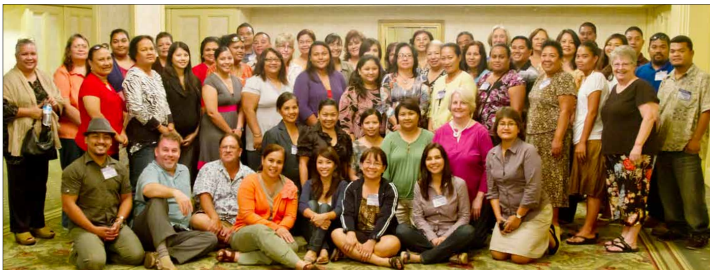
Sixty-two participants completed a two-day training entitled, “Deaf/Hard of Hearing: Understanding Leads to Success.”