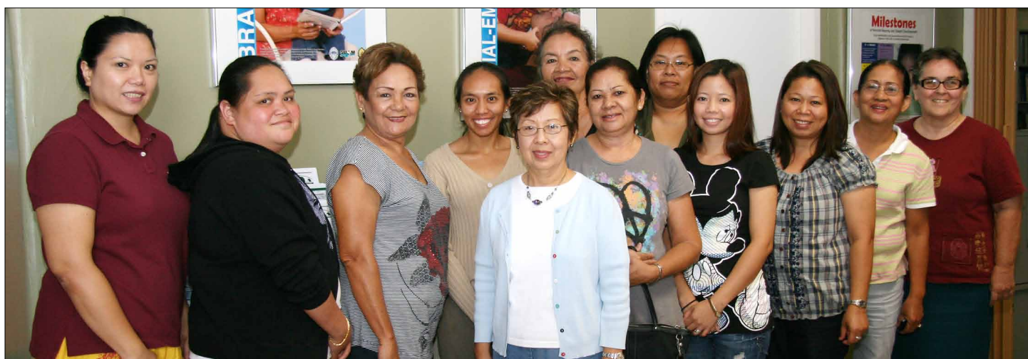
On April 23, Guam CEDDERS hosted Part Two of the "Ages and Stages Questionnaire (ASQ)" training with 12 participants from various child care agencies attending. The Ages and Stages Social Emotional edition focused on social emotional behaviors, questions, and scoring. The participants were also given a set of their own ASQ-SE Kit and provided access to the Ages and Stages online system. The child care providers were also taught how to navigate the online system; the aggregated reports that could be generated from the system and the privilege of having families access the questionnaires on their own time and pace. On-going training for the online Ages and Stages system will be held every first Friday of the month at Guam CEDDERS House 22.