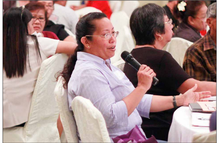
A parent asks a question during the Special Education Parent Leadership Training Series Workshop held on March 26. A total of 165 parents attended the workshop.

The anticipated outcome of the Special Education Parent Leadership Training Series is two-fold: (1) Increase parents' knowledge of special education programs and services; and (2) Develop a cadre of parents who are proficient in the special education process who will then be available to serve as advocates/mentors for other parents of children with disabilities receiving special education services. To build their competency in each step of the special education process, parents participating in the series will be provided follow-up sessions that will cover more in-depth information. To date, two two-hour follow-up sessions have been conducted on April 17 and May 18, with the first follow-up session focusing on understanding evaluation reports and the second session focusing on eligibility determination. The next session of the series will be held on June 18 and will focus on the development, review, and revision of the IEP as well as placement in the least restrictive environment. For the follow-up sessions, invitations were extended only to parents who attended the initial session in March.