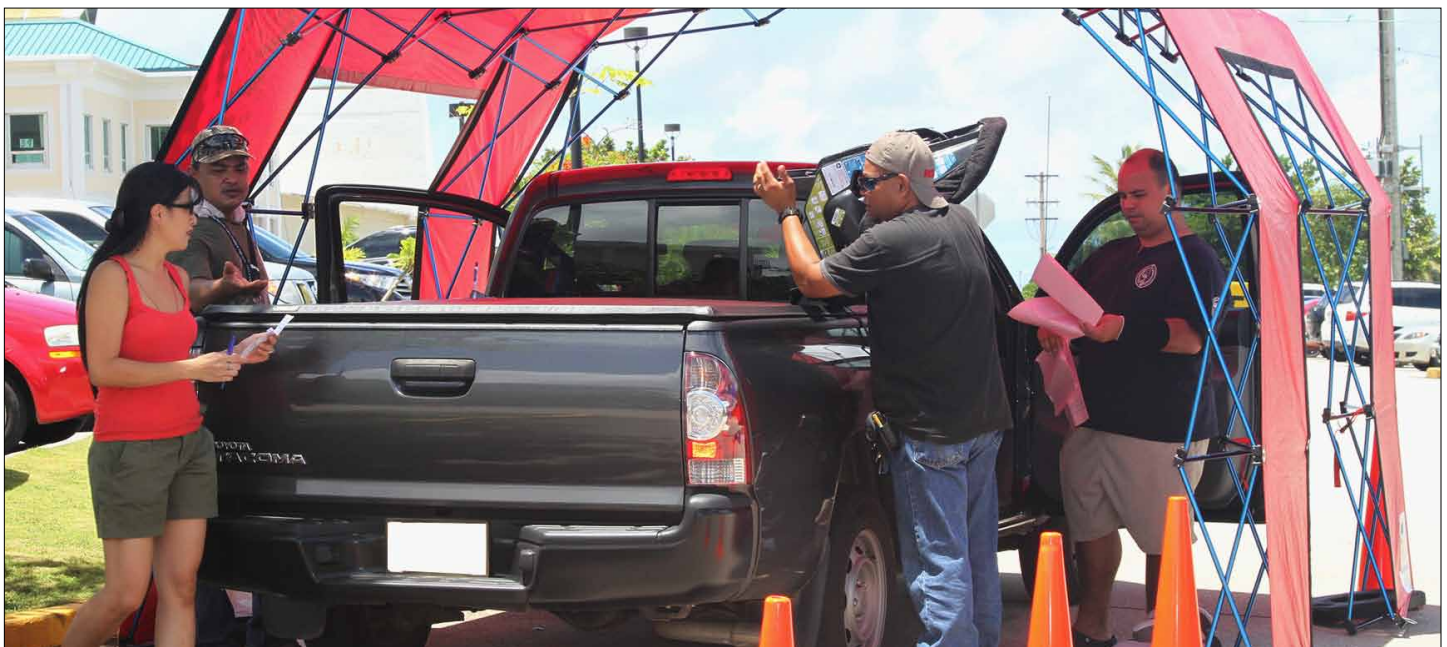
Families have child car seat securement systems inspected and evaluated by Department of Public Works experts.