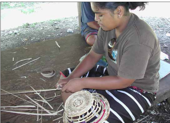
Monitoring activities included classroom observations.