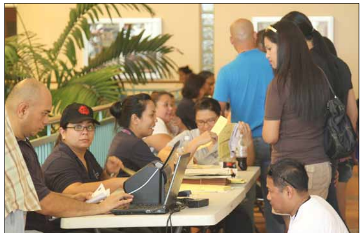
Parents check out vendors and various programs during the Children's Healthy Development Fair.