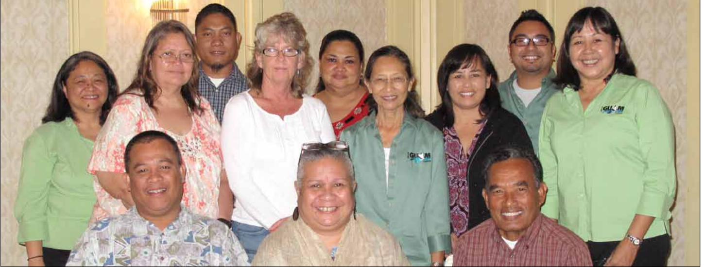
PACIFIC Project staff and Special Education Leadership from American Samoa, Commonwealth of Northern Mariana Islands, Federated States of Micronesia, Guam, Republic of the Marshall Islands, and Republic of Palau met at the Guam Marriott Resort & Spa on April 6.

The Pacific Assessment Consortium (PAC6) Implementing Fully Innovative Change (PACIFIC) Project is in its final year of implementation. This final year represents a transition year of support from the PACIFIC Project to the National Center and State Collaborative (NCSC), a newly funded Office of Special Education Programs (OSEP) consortium grant awarded to PACIFIC Project partner University of Minnesota National Center on Educational Outcomes (NCEO). The PAC6 is one of 19 states/entities in the NCSC consortium. The NCSC provides the continuity in technical assistance and training to ensure students with significant cognitive disabilities achieve increasingly higher academic outcomes and leave high school ready for post-secondary options.