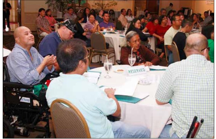
Conference participants listen intently as information regarding accommodations on the job are addressed.

case study examples. The examples illustrated the use of AT and environmental restructuring to provide workplace accommodations. Moreover, she shared the various resources available to employers and employees to assist with funding.