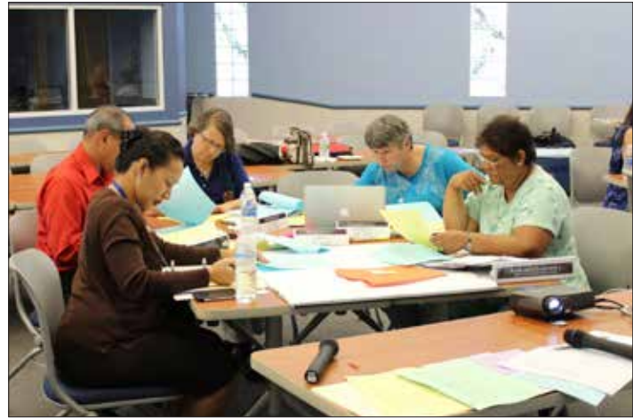
At the most recent quarterly meeting, on December 11, 2012, Research Alliance 3 members, including Micronesian migrant learner family members, community opinion leaders, community organization representatives, professionals from the Guam Department of Education, and faculty/administrators from Guam's institutions of higher education, analyzed different observation tools for the Year 2 study that will be used to gauge English as a Second Language instructional practices in elementary school classrooms.