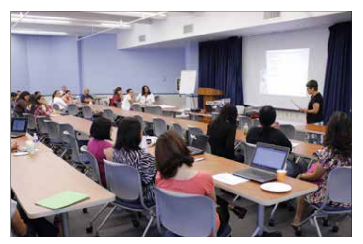
Eight Department of Education School Teams received feedback and additional technical assistance on the current assessment of Response to Intervention (RTI) implementation during training held at the University of Guam.

A work session was facilitated by Guam CEDDERS for eight school teams participating in the Response to Intervention (RTI) initiative. The session was held on November 6, 2012 at the UOG School of Business and Public Administration (SBPA) and focused on assessing the current status of the implementation of RTI, as well as moving on creating Tiers 2 and 3 supports for students needing targeted which was