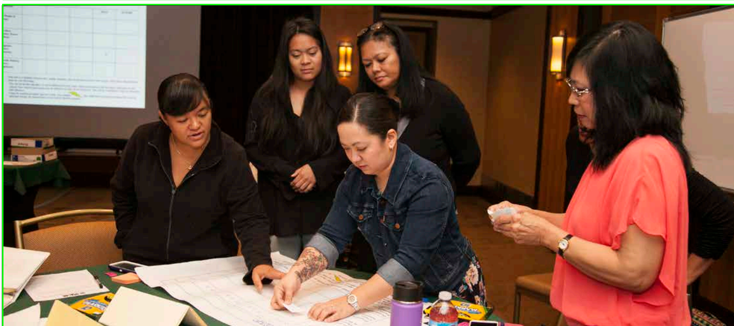
Guam CEDDERS facilitated a workshop attended by teams from various schools to sustain the Positive Behavioral Intervention Supports (PBIS) initiative in Guam Department of Education schools on August 26. Shown here are the PBIS teams from V.A. Benavente Middle School (top photo) discussed the factors that sustains PBIS while Adacao Elementary (bottom photo) are shown completing their PBIS Histomap.

In collaboration with the Guam Department of Education Positive Behavioral Interventions and Supports (PBIS) coaches, Guam CEDDERS facilitated a beginning of the year training for school climate cadre (SCC) team members from 26 elementary schools, eight middle schools, one high school, and representatives from the Guam Department of Youth Affairs correctional and educational program. The training was held on August 24 & 25 for elementary schools and on August 26 for secondary schools at the Westin Resort.