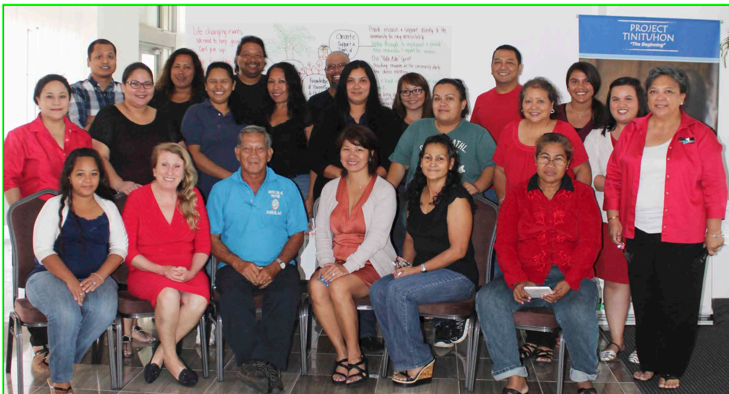
Facilitated by Guam CEDDERS, early childhood providers conducted a training for village mayors and their key staff on "Protective Factors for Strengthening Families" on September 14 at the Leo Palace Hotel, Yona.

Representatives from six mayors' offices from around the island met on September 14 at Leo Palace Resort to learn more about the Strengthening Families™(SF) Protective Factors. Guam's certified trainers from Guam CEDDERS, Department of Public Health and Social Services (DPHSS) Project Kariñu, Guam Identifies Families' Terrific Strengths (G.I.F.T.S.) Organization, Guam Behavioral Health and Wellness Center (GBHWC) - I Famagu'on-ta and icareguam facilitated a four-hour introductory training on the protective factors. The purpose of the training was to: