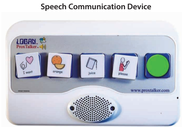
Speech Communication Device

The GOAL-AT and GGT Loan Programs can help people with disabilities acquire needed assistive technology.