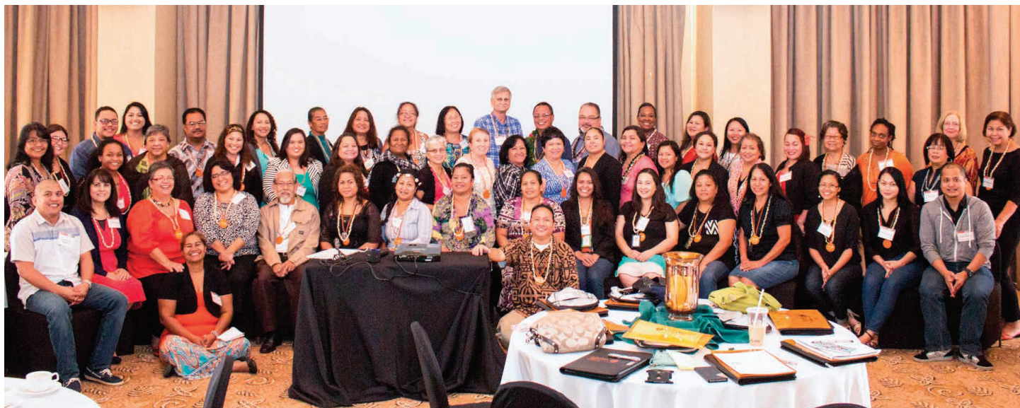
Stakeholders involved with Project Kariñu since its inception and through its current phase gathered for a photo during the “Recognizing, Regrouping, Regrouping, and Rejuvenating: Families, Friends, and Collaborators of Project Kariñu” appreciation event on September 25th at the Outrigger Guam Resort.

In 2009, the U.S. Department of Health and Human Services, Substance Abuse and Mental Health Services Administration (SAMHSA) awarded the Guam Department of Public Health and Social Services (DPHSS) a six-year Cooperative Agreement for Project Kariñu. The goal of this system of change initiative is to develop and implement an early childhood system of care for children birth to five years with social, emotional, and behavioral needs and those young children who are at imminent risk for developing these disorders. To address specific requirements of the Cooperative Agreement, DPHSS partnered with Guam CEDDERS. In January 2010, Guam CEDDERS entered into a six-year Memorandum of Agreement with DPHSS to design and implement the evaluation component for Project Kariñu. Guam CEDDERS also was contracted to facilitate staff training, technical assistance, and cultural and linguistic competency.