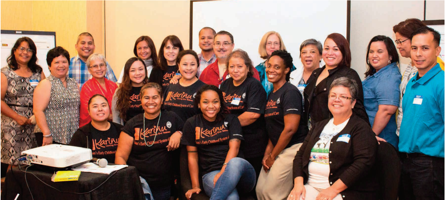
Staff from the Four Sisters (Project Tinituhon, Kariñu, Bisita, and Guam LAUNCH) pose for a photo at the completion of the Strategic Planning Retreat held on September 23 at the Outrigger Guam Resort.

On Wednesday, September 23, staff from Project Tinituhon and the Department of Public Health and Social Services (DPHSS) – Project Bisita I Familia, Project Kariñu, and Guam LAUNCH held a strategic planning session.