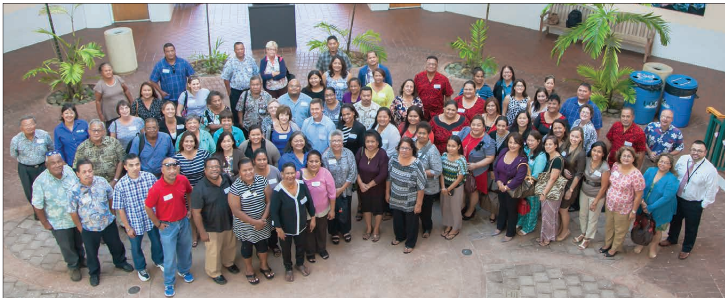
On Monday, December 7th, over 60 entity team members from American Samoa, CNMI, FSM, Guam, RMI, and ROP engaged in the first day of the week-long OSEP Pacific Meeting at UOG.