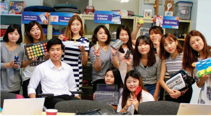
Students from Jeju University in Jeju City, South Korea, hold up various assistive technology devices during a visit to the GSAT Center on August 15 & 29, 2014 while on a two week English Adventure Program hosted by the University of Guam Professional and International Programs.

The Guam System for Assistive Technology (GSAT) conducts outreach to a variety of disciplines and interest groups each year. GSAT, with the help of its Advisory Council, targets assistive technology (AT) outreach to specific populations where an AT need has been identified. Sometimes outreach events are small, more intimate, and requested by members of the community themselves. Other times, folks make their way to GSAT upon referral from another agency or as part of a class assignment or required job training. One thing is certain for all outreach efforts conducted by GSAT – participants will know about the services GSAT offers the community and learn about the value assistive technology can have on increasing independence and quality of life for individuals with disabilities.