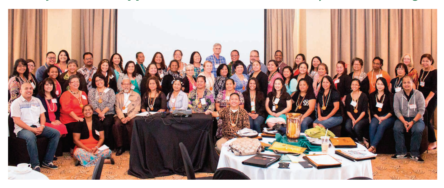
Stakeholders involved with Project Kariñu since it's inception and through it's current phase gathered for a photo during the "Recognizing, Regrouping, Regrouping, and Rejuvenating: Families, Friends, and Collaborators of Project Kariñu" appreciation event on September 25th at the Outrigger Guam Resort.

In 2009, the U.S. Department of Health and Human Services, Substance Abuse and Mental Health Services Administration (SAMHSA) awarded the Guam Department of Public Health and Social Services (DPHSS) a six-year Cooperative Agreement for Project Kariñu. The goal of this system of change initiative is to develop and implement an early childhood system of care for children birth to five years with social, emotional, and behavioral needs and those young children who are at imminent risk for developing these disorders. To address specific requirements of the Cooperative Agreement, DPHSS partnered with Guam CEDDERS. In January 2010, Guam CEDDERS entered into a six-year Memorandum of Agreement with DPHSS to design and implement the evaluation component for Project Kariñu. Guam CEDDERS also was contracted to facilitate staff training, technical assistance, and cultural and linguistic competency.