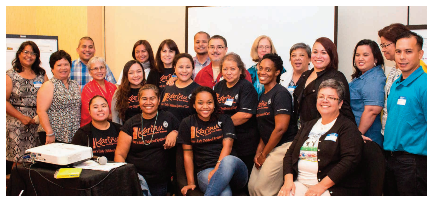
Staff from the Four Sisters (Project Tinituhon, Kariñu, Bisita, and Guam LAUNCH) pose for a photo at the completion of the Strategic Planning Retreat held on September 23 at the Outrigger Guam Resort.

On Wednesday, September 23, staff from Project Tinituhon and the Department of Public Health and Social Services (DPHSS) – Project Bisita I Familia, Project Kariñu, and Guam LAUNCH held a strategic planning session.