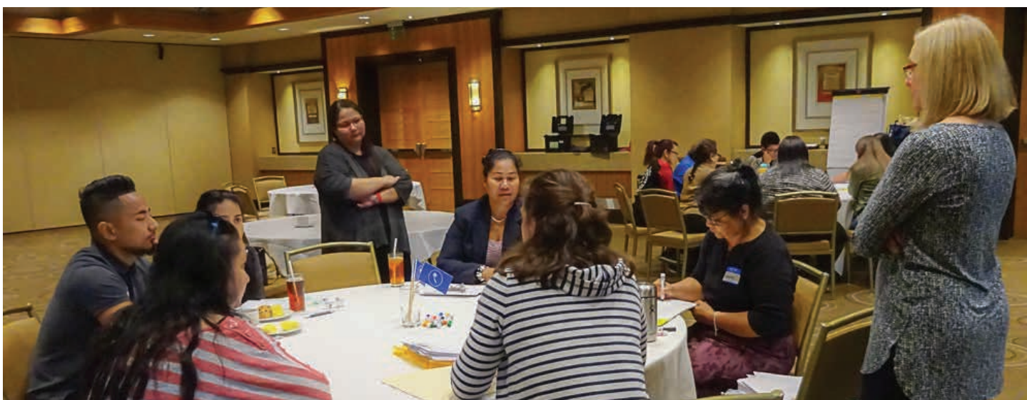
Participants discuss activities and handouts used in the CSEFEL Pre-K Parent Module: Positive Solutions for Families during the Cultural Conversations Café facilitated by the CEDDERS LAUNCH Evaluation Team on February 28, 2018 at the Westin Resort Guam.