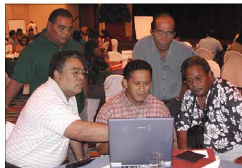
The Chuuk team engage in intense discussion as they work on conceptualizing their activities and strategies for the Improvement Plan.