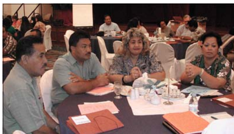
The team from American Samoa listens attentively to the presentation on the Annual Performance Report.