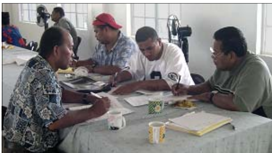
IEP Teams work on case studies to develop IEP's using the new forms.

The 2004 Special Education Manual is still in draft form, but will be finalized for full implementation of the procedures for school year 2004-2005. Funding for the training was provided through the collaborative efforts of WRRC and the FSM National Government.