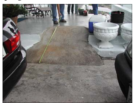
Ramps improve accessibility. Slopes need to be 1:12.

"Best Practices for Inclusion" are implemented in each center. Data gathered from these assessments will be included in an individualized report highlighting identified strengths, technical assistance priorities, needs, and recommendations on ways to improve their facility accessibility and program.