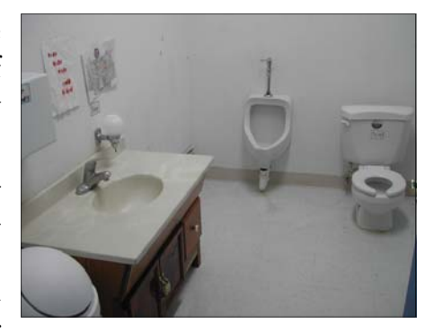
This restroom has accessible clear space and fixture heights.

Some of the a reas of accessibility examined by Mr. Terlaje included parking stalls and drop off areas, exterior travel routes, door entrances, interior travel