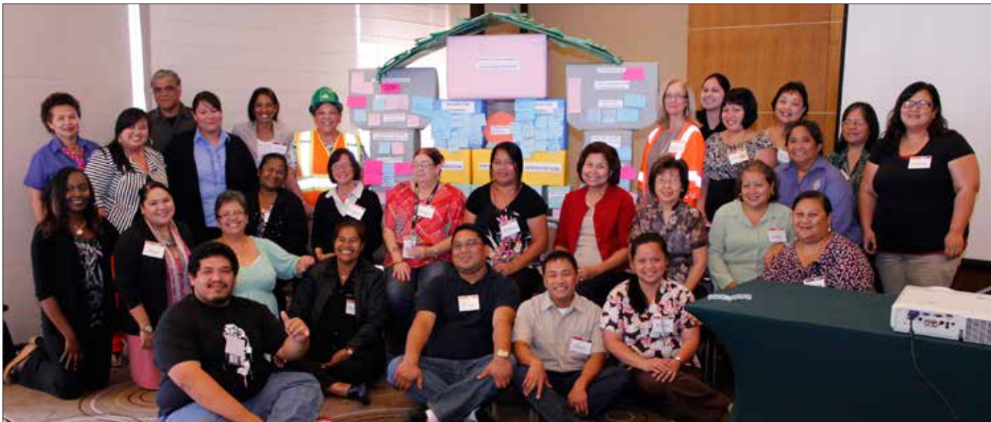
Project Kariñu Strategic Planning Retreat participants constructed a visual representation of the values, principles, and structures that come together to create Guam's early childhood system of care.

Project Kariñu, Guam's early childhood system of care for children ages birth to 5 years, provides mental health promotion, prevention, and early identification and intervention services for young children and their families. Since June 2011, Project Kariñu has served over 130 children with social emotional and behavioral needs as well as children who are at-risk for experiencing mental health problems. In addition to providing outreach and direct services, Project Kariñu is building capacity within Guam's early childhood workforce to address the mental health needs of young children and to establish the infrastructure and collaborative partnerships necessary to ensure that a comprehensive and coordinated service delivery system is in place.