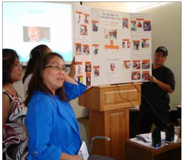
The staff from the Women, Infants, and Children (WIC) Program present their project outlining developmental milestones during a workshop on Child Development facilitated by Guam CEDDERS staff on April 26. Support for the training was provided by the State Advisory Council Grant.